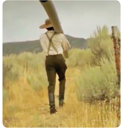
AFTER MANY YEARS, HE GREW WEARY OF HAULING BUCKETS.

Every day he hauled water from the nearest source to his village miles away. If he wanted to make more money, he would simply work longer hauling buckets.