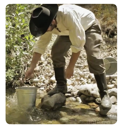
THERE WAS A MAN WHO HAULED BUCKETS OF WATER FOR A LIVING.

Every day he hauled water from the nearest source to his village miles away. If he wanted to make more money, he would simply work longer hauling buckets.